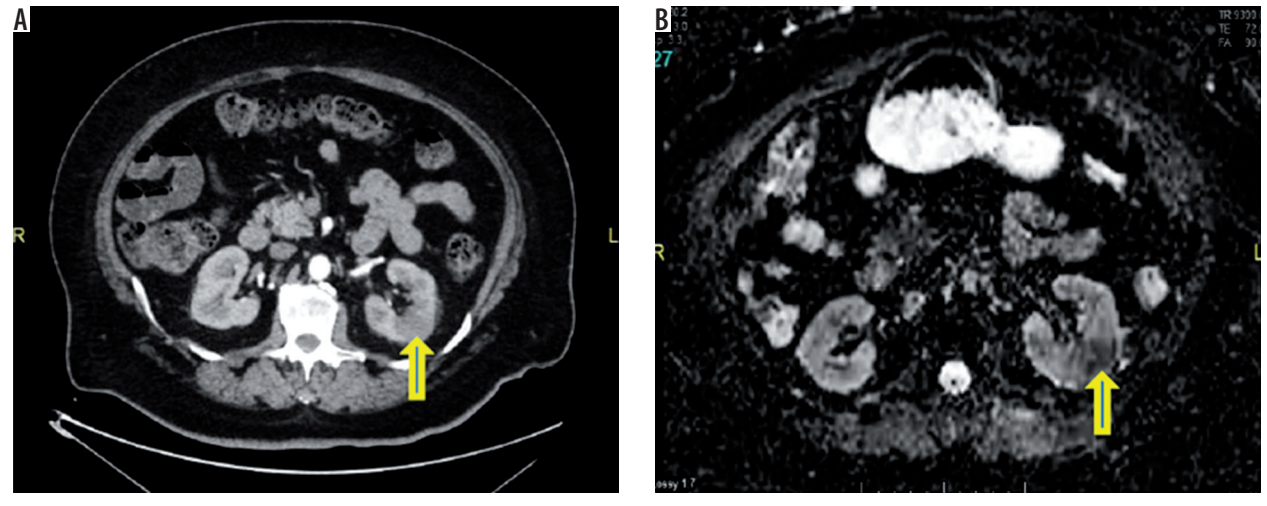
Figure 1. A) Contrast-enhanced computed tomography shows areas of reduced attenuation (arrow) during the nephrographic phase on left side. B) Corresponding ADC map appear hypointense (arrow) (mean ADC of the infected foci is 1173 × 10<sup>-6</sup> mm<sup>2</sup>/s)

he detection of renal abscess is seen in Figure 2, and the DW imaging sequence of all three poles in a case of acute pyelonephritis is shown in Figure 3. It was clearly shown that the areas of affected renal parenchyma ADC value in mm<sup>2</sup>/s was found to be consistently lower. The ADC value of the affected foci ranged between 1143.30 and 1309.81 (10<sup>-6</sup> mm<sup>2</sup>/s) (Table 4). In our study we had nine patients with renal abscess, and these abscesses were easily detected on DW MR imaging, especially with higher b values. The ADC values in kidney abscesses were lower than the APN lesions. ADC values in the abscessed area ranged from 651.51 to 943.45 × 10<sup>-6</sup> mm<sup>2</sup>/s. The ADC in the non-affected renal parenchyma consistently ranged between 1900 ±200 × 10<sup>-6</sup> mm<sup>2</sup>/s in all the patients included in our study, which was reaffirmed by other studies,